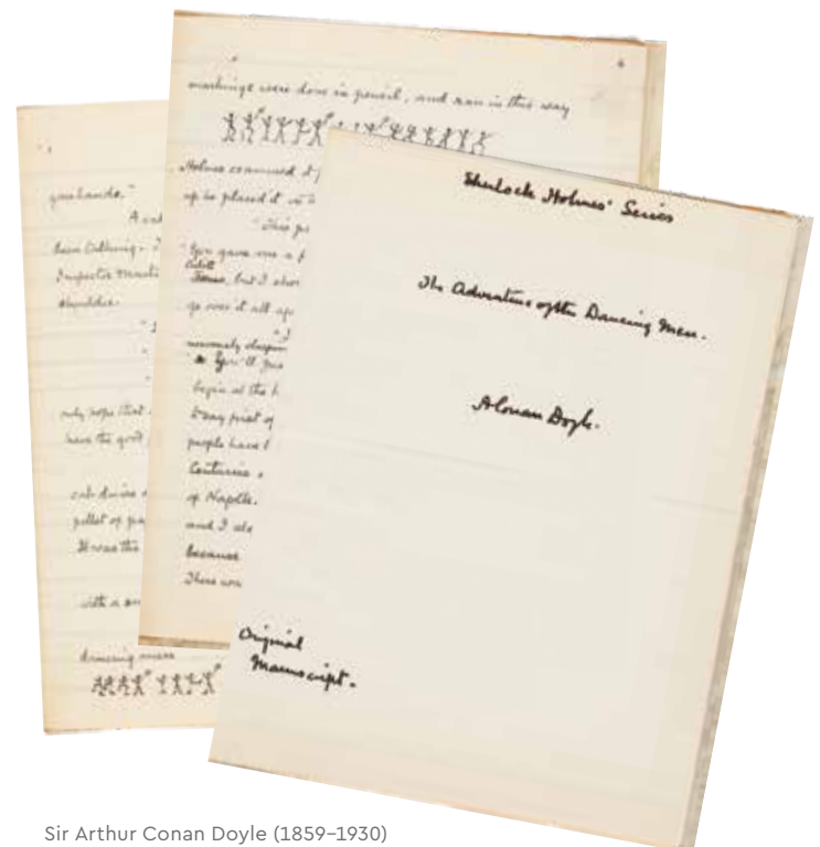
Sir Arthur Conan Doyle (1859-1930) The Adventures of the Dancing Men , circa 1903 Autograph manuscript, signed three times, 53 pages, bound in plain vellum Estimate: $500,000+

Doyle’s manuscripts for classic stories such as The Retired Colourman , The Illustrious Client , and The Creeping Man are held in British museums and institutions. The manuscript for The Adventures of the Dancing Men previously was held in the collection of a Texas book dealer.